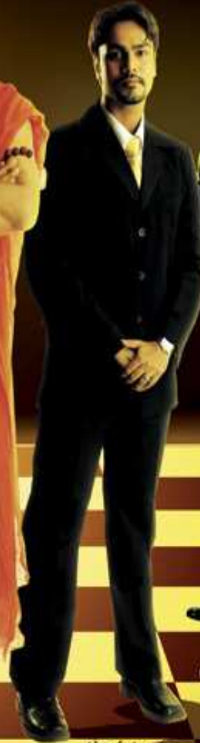
the genius cfo