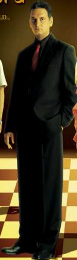
the megalomaniac ceo