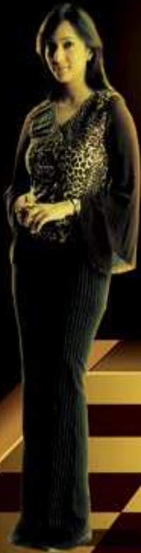
the opportunist pro