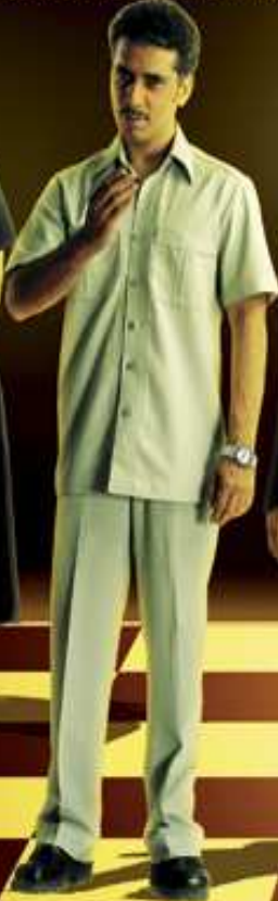
the ceo's man