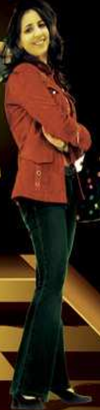
the supporting wife